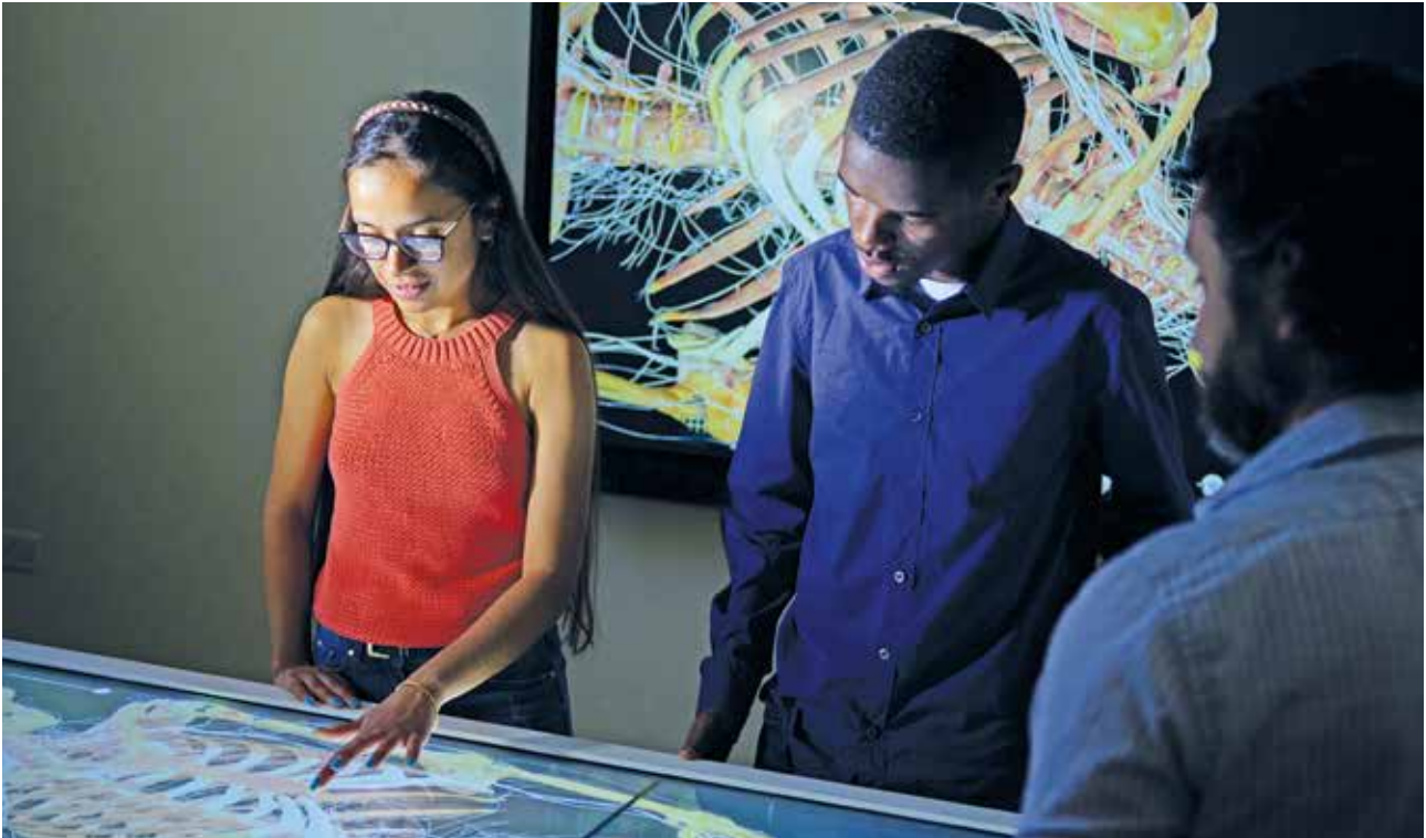
Students using the college’s Anatomage Table purchased with the support of alumni and friends, as part of the 140th Anniversary Appeal.