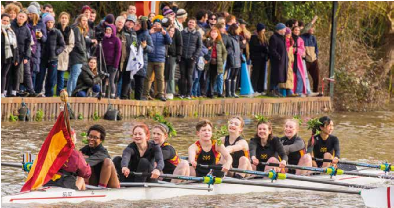
A victorious (and happy) W1 crew winning their blades at Lent Bumps March 2023.