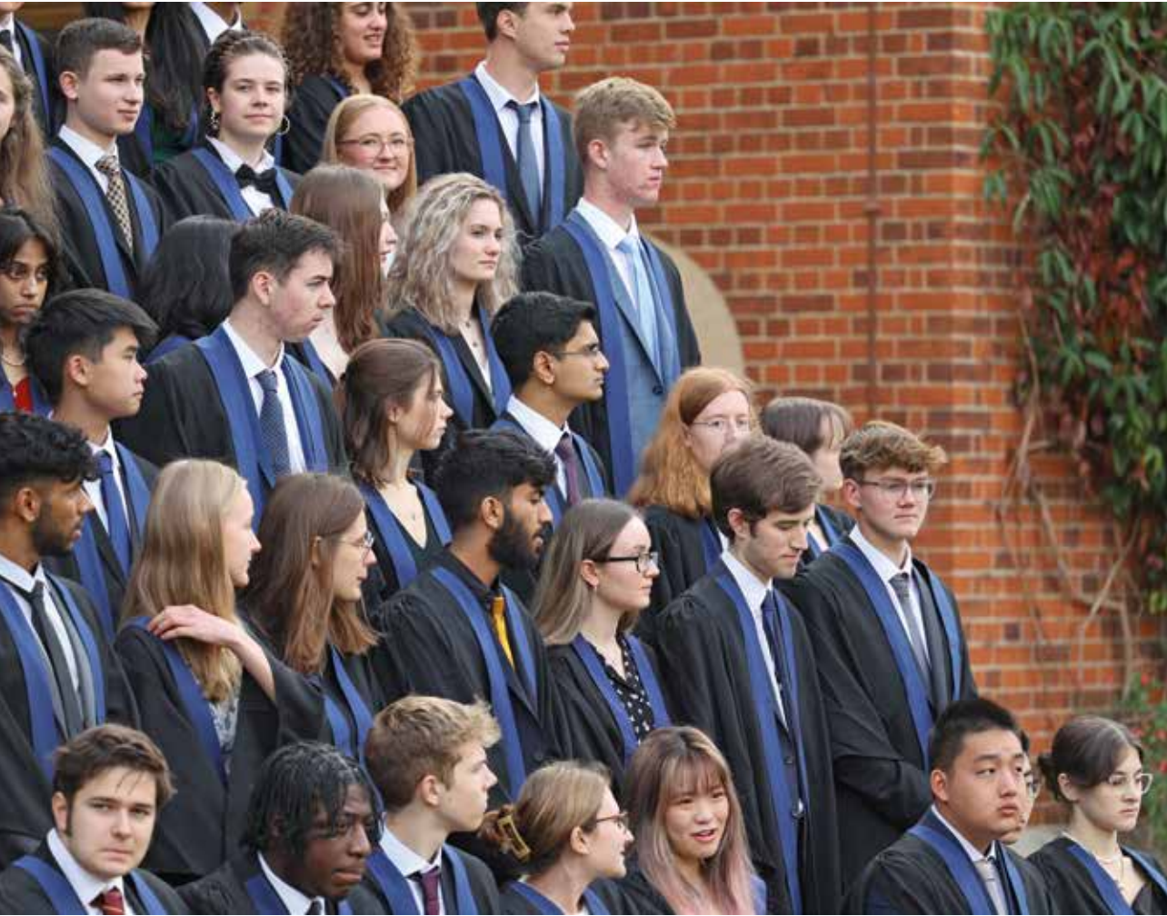
Our 2022 undergraduate matriculants.