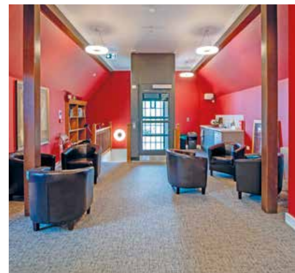
The first floor of the Old Library has been transformed into the Alumni Parlour and office space for the development and alumni relations team.

And finally, in the background, wider college estate refurbishments continue – with rolling annual staircase upgrades and essential bathroom refurbishments. We continue to look for