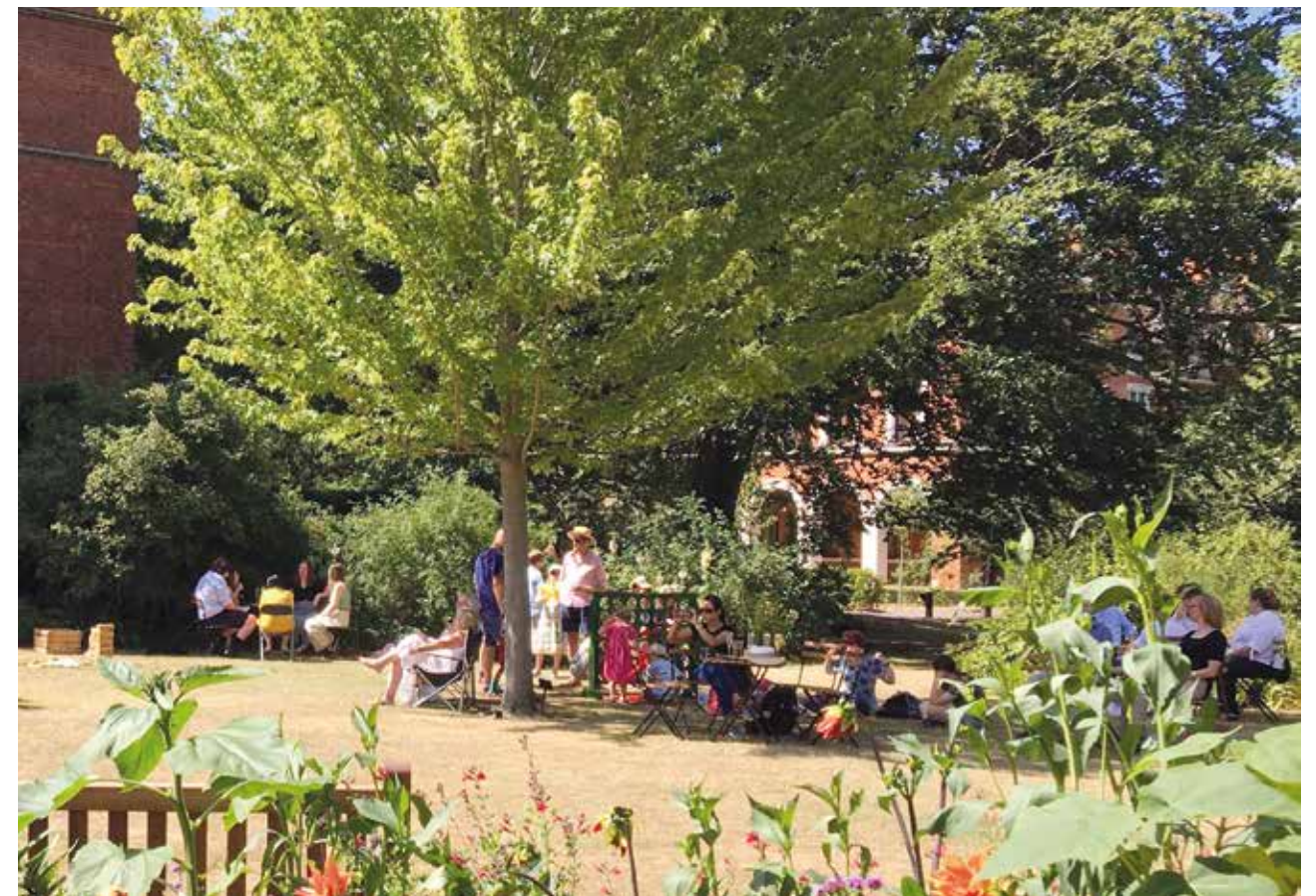
Alumni, family and friends of all ages enjoyed perfect weather at the Family Day in July.

you who continue to donate to the college year in and year out. This regular giving, often of modest amounts, is so helpful and increasingly important, especially currently when everybody is feeling the effects of a rise in the cost of living. A major source of the college's income is student fees, and while the cost of teaching and looking after our students rises year on year, the college's fee income remains the same – and is unlikely to change any time soon. This is a challenging business scenario with no easy solution. But your regular donations help us to meet the shortfall and ensures we have sufficient funds to provide the bursaries and additional hardship grants that at least 25% of our students require. In turn, they can get on with their education and make the most of their time