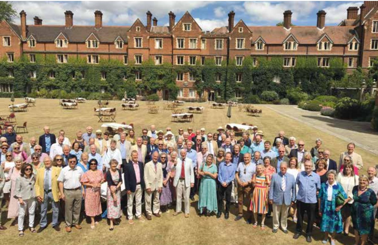
On a hot summer’s day, we hosted a lunch for our regular givers.

We’ve been compiling a version of this Annual Report for a number of years now but it’s still a surprise to see the impressive number of individuals who donate to the college one way or another each year. 2022 was no exception and it’s with some pride and a greater amount of pleasure that we celebrate the nearly 1600 individuals who have been able to help. In recent years, every facet of student life has been improved by your philanthropy. Every single Selwyn undergraduate is helped thanks to your financial support– with those in greatest need receiving the greatest benefit. This ensures our students get the best possible start in their careers, whether that’s in AI, teaching, medicine, politics, finance, law or engineering – we know they will make a difference and hopefully help make the world a better place for all of us. If you would like to learn more about becoming a supporter, please scan the QR code opposite. We’re piloting them this year – feedback is always welcome.