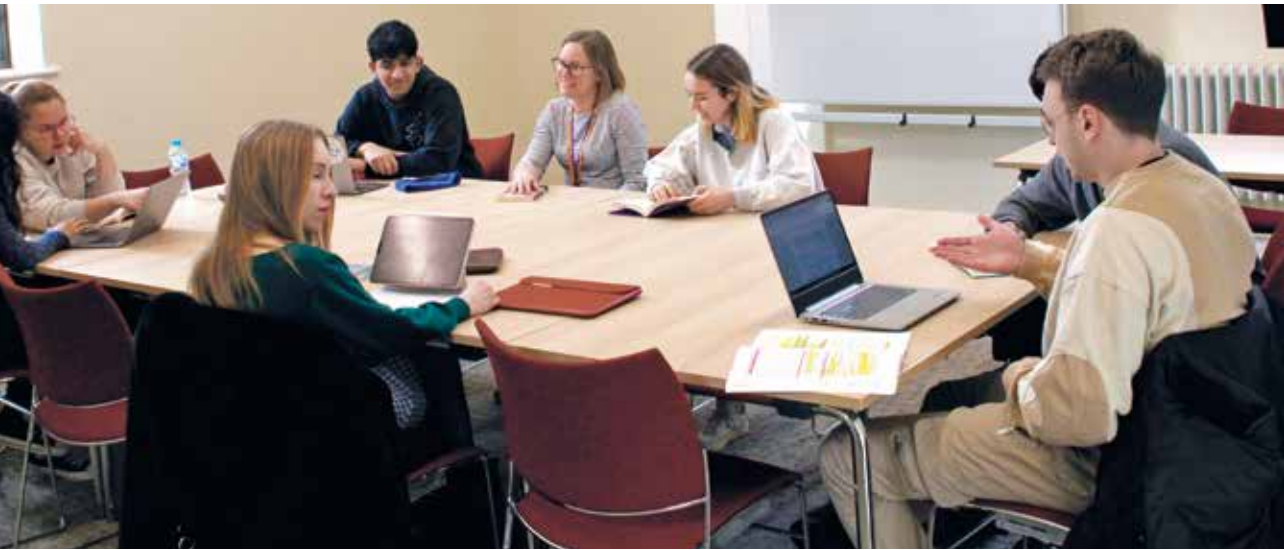
Students engaged in a seminar in a new teaching room in the Old Library.