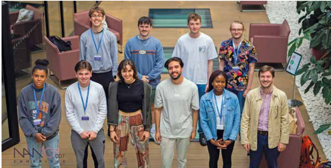
Last summer Selwyn hosted students taking part in the first NanoFutures Scholars internship programme, a pioneering new approach to postgraduate widening participation, generously funded by a Selwyn donor.