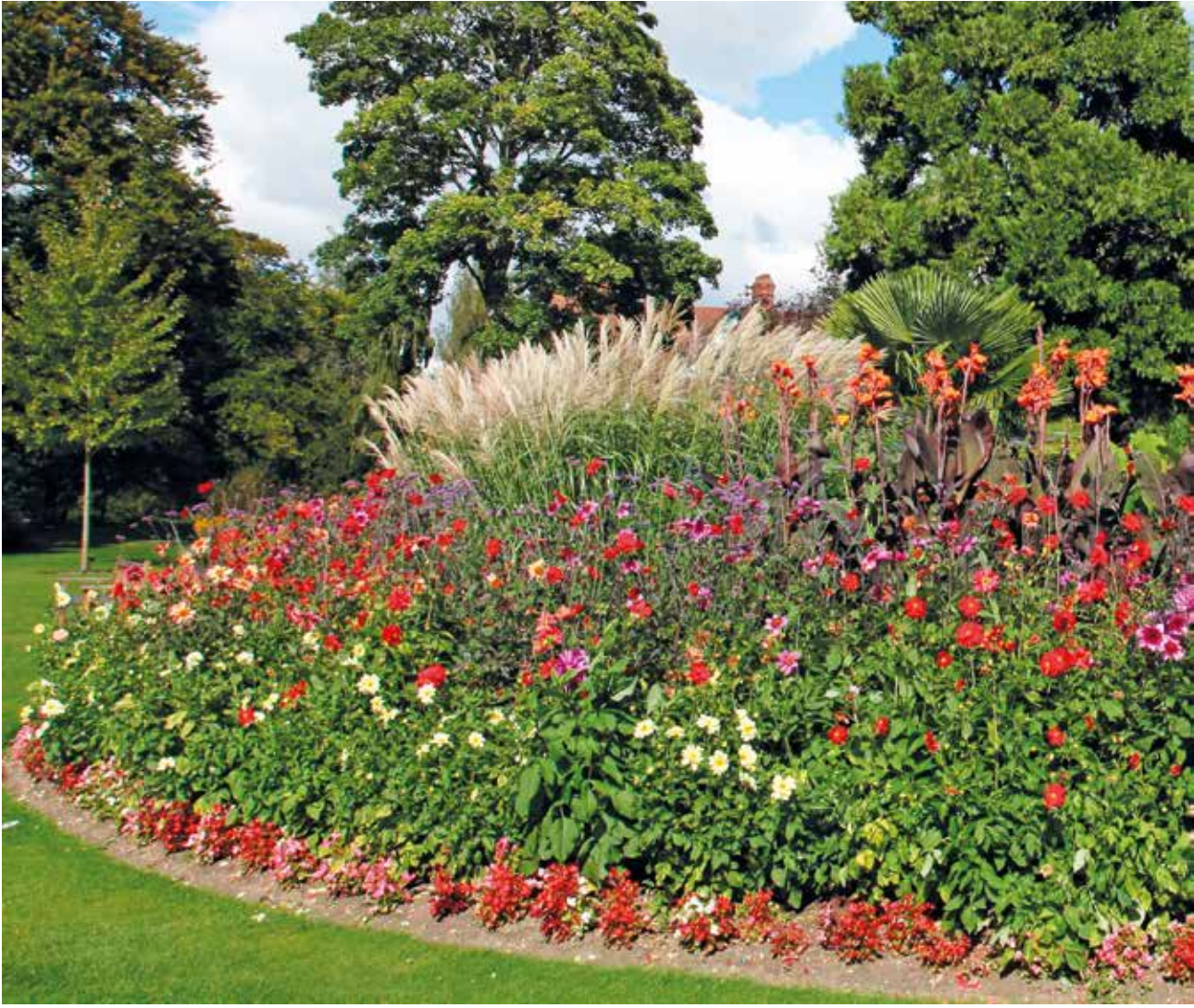
The Victorian Border, in the centre of the main garden, always looks its best in the height of summer.

www.sel.cam.ac.uk/alumni/ friends-selwyn-gardens