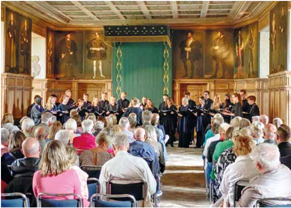
The choir perform in the Rikssalen, Stockholm.