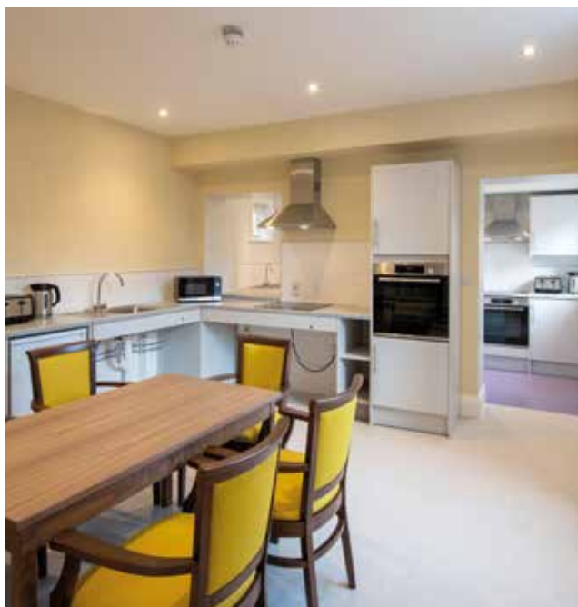
The newly refurbished hostels will provide more than 30 rooms for graduate students.