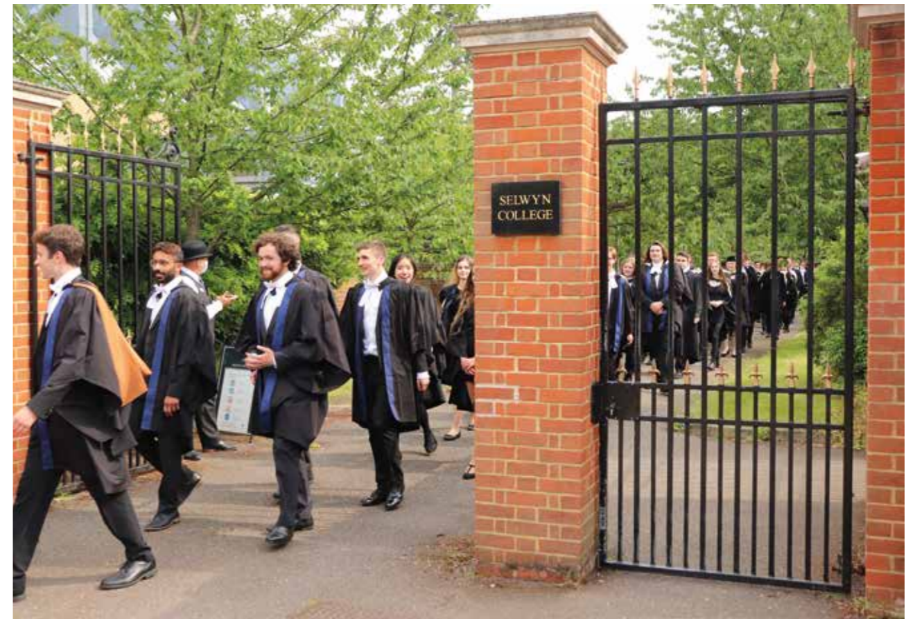
Graduands on their way to Senate House in July.