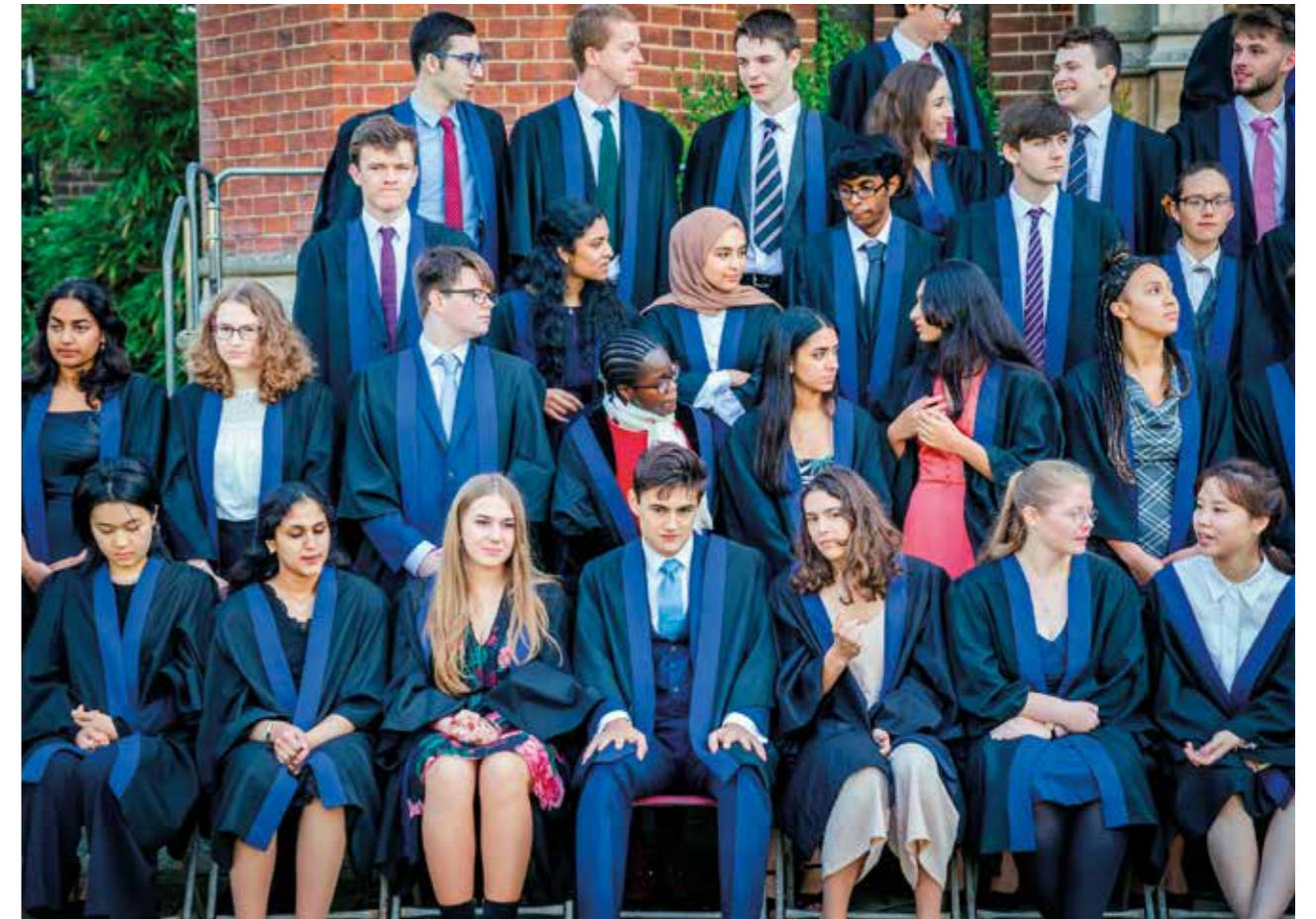
Full of promise: the 2021 matriculands.