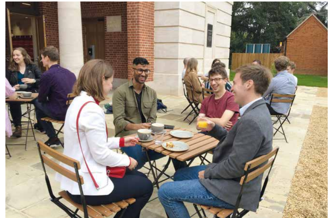
Afternoon refreshments outside the Quarry Whitehouse Auditorium offer an informal start to a reunion weekend.

Although every college in Cambridge is different in all sorts of ways, it's still tempting to make comparisons between ourselves. And while Selwyn may not be the oldest, largest or wealthiest college in town, we do nevertheless enjoy a tremendous level of regular support from you – our alumni and friends, which I know makes us the envy of many others. The following pages record the names of nearly 1,800 individuals who support almost every facet of student life and experience at Selwyn. Quite simply, we would not be the college we are – or able to do what we do – without your help; thank you.