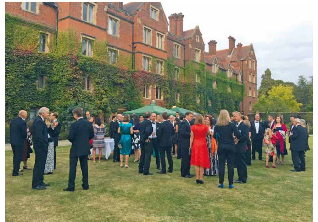
Alumni gather in Old Court before their reunion dinner in September.

But it's not all champagne and speeches! Underlying the celebrations is the serious and important work of supporting our students and helping them to get the best out of their Cambridge education. To this end, we continue to receive generous help with our bursary and hardship grants that are disbursed to approximately 25% of our undergraduates – and our successful December telephone campaign once again enjoyed great support. Thanks to a widening of the eligibility criteria, many more Selwyn students are now entitled to bursary support. That's