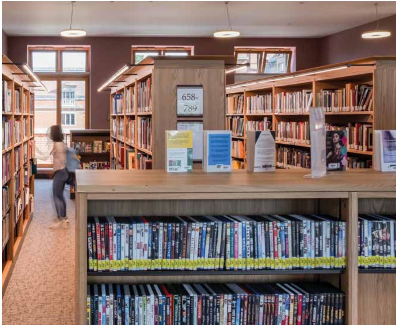
The Bartlam Library open for business.

As I wrote last year, “We and our successors will thank ourselves later for putting our best foot forward now.”