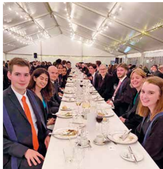
Undergraduate matriculation dinner, October.