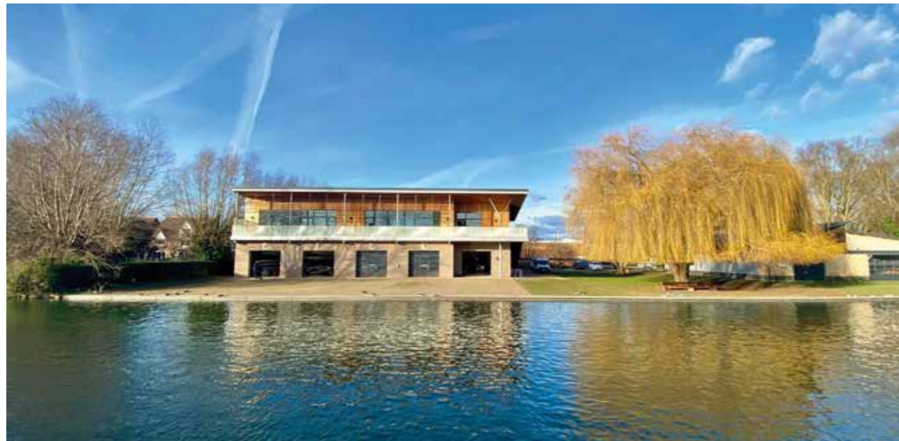
Ready for action: the Selwyn boathouse.

With the autumnal easing of restrictions for rowing on the Cam, Selwyn's crews have been training hard and enjoying some great results. Highlights from the Friends in 2021 must be the successful fundraising effort that resulted in the club being able to purchase two new VIII's – one each for the women and men's crews; thank you! A very high percentage of Selwyn rowers have learned to row from scratch while at Cambridge and we would love to encourage more students to give it a go. To do this, we need to expand the number of 'Friends' so we can provide the kit, equipment and training they need. If you used to row at Selwyn, but have not yet joined the Friends, please consider helping. For more information about the Friends, feel free to contact the Chair, Brian Hornsby, at brianjhornsby@gmail.com .