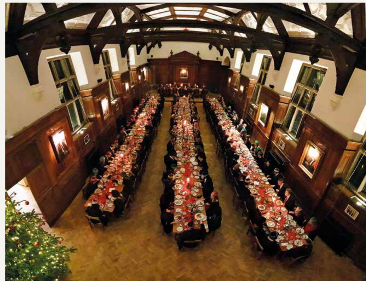
A full Hall for a Christmas formal.

One of the ways in which Selwyn really got together in Easter term last year was through college sports. Rowing had more novices than their entire history (myself amongst them), and fewer dropouts than ever before (possibly due to the warm weather and late mornings). The Selwyn College Croquet Society – revived by my friends – entered a whopping 14 teams into a league consisting of around 30 teams. Sharing three mallets that had seen some woodworm in their time, it is perhaps unsurprising that none of our teams made it to the final (though my friends will forever brag about the time that they almost beat the university boat club's team).